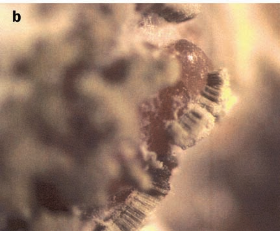
Figure 4. Egg masses produced by blacklegged ticks in the laboratory. (a) Eggs produced by a female that had not been treated with the fungus Metarhizium anisopliae; these eggs hatched normally. (b) Eggs produced by a female that had been treated with M. anisopliae; these eggs died.

trols. These results suggest that these fungal pathogens reduce tick fitness (fecundity and body mass), with likely negative impacts on population growth beyond that imposed by direct mortality alone.