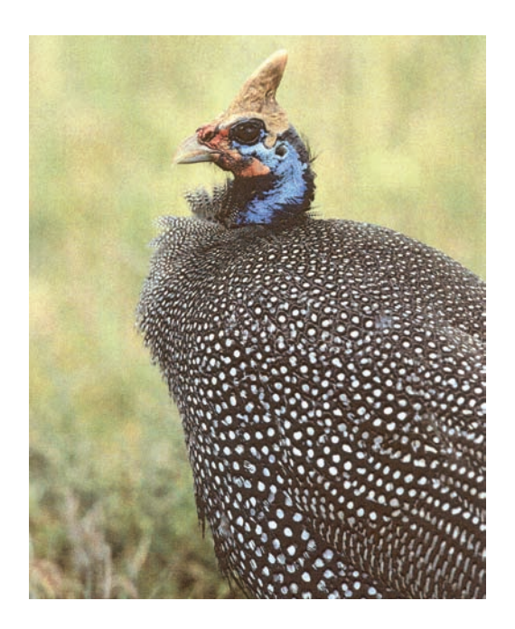
Figure 3. The helmeted guineafowl (Numida meleagris). The cult status of this bird as a tick predator, and hence a protector of people from exposure to tick-borne infections, appears to be unwarranted. Although evidence suggests that these birds eat adult ticks, they appear not to reduce the numbers of nymphs (the stage responsible for most cases of Lyme disease) sufficiently to have a strong protective effect.

Parasitoid wasps and flies are among the most effective agents in the biocontrol of insects (Kimberling 2004). Parasitoids are often, although not always, specialists on one host