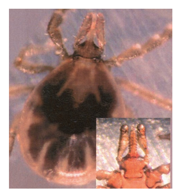
Figure 1. Photomicrograph of a nymphal blacklegged tick (Ixodes scapularis), dorsal view. Inset shows a ventral view of the mouthparts, with the jagged-edged central hypostome and the two palps on each side. These mouthparts are embedded in the host while the tick takes a blood meal.

Small and medium mammals, Small and medium Summer ground-dwelling birds mammals, groundarva Autum Adul Large mammals Winter