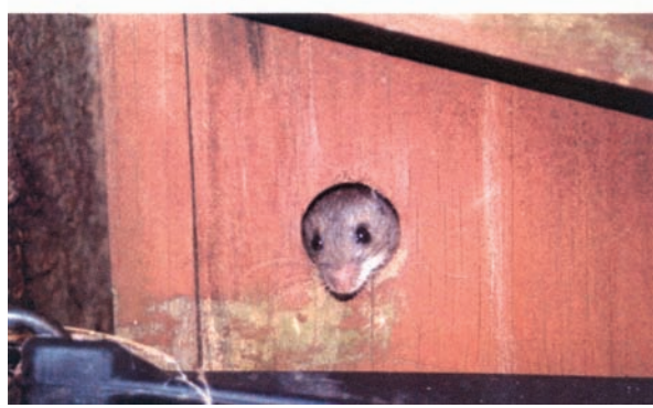
Figure 5. A nest box (top) attached at chest height to a tree on an experimental plot at the Institute of Ecosystem Studies in Millbrook, New York. These nest boxes are frequently colonized by white-footed mice (Peromyscus leucopus, below), which are a primary host for larval blacklegged ticks and the principal natural reservoir for Lyme disease spirochetes (Borrelia burgdorferi). Treating the cotton nesting material in these nest boxes with Metarhizium anisopliae resulted in modest, local reductions in the abundance of nymphal ticks.

of nest boxes (only about 35% of mice in field plots were known to use the nest boxes), and by deploying this method in suburban forests where mice tend to be abundant and relatively few alternative hosts for larval ticks occur.